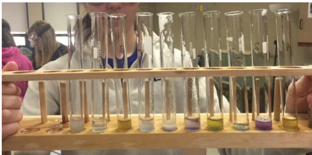
Biuret Reagent (above)